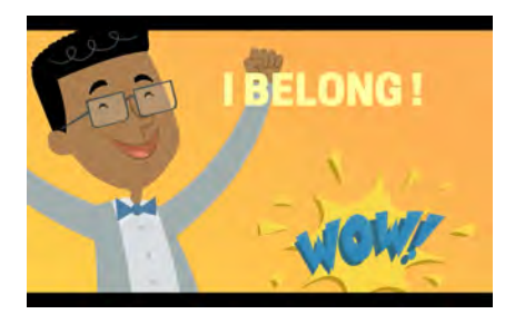
Groups that work