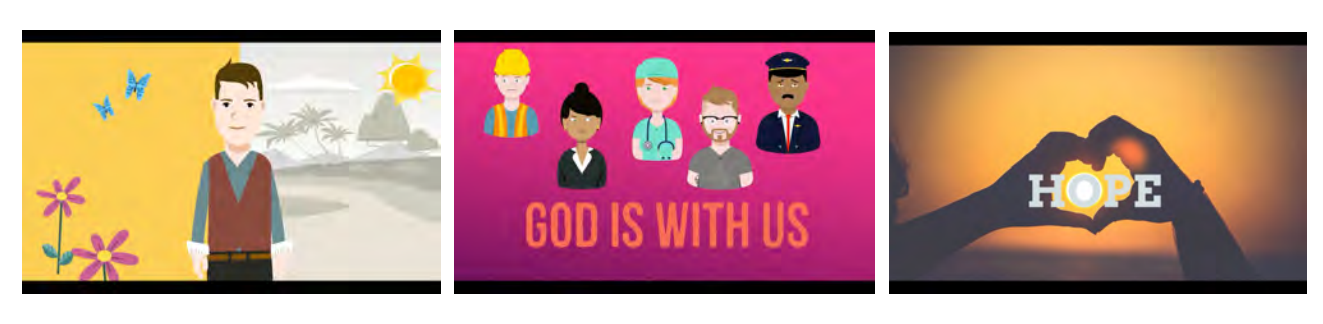
God loves and cares