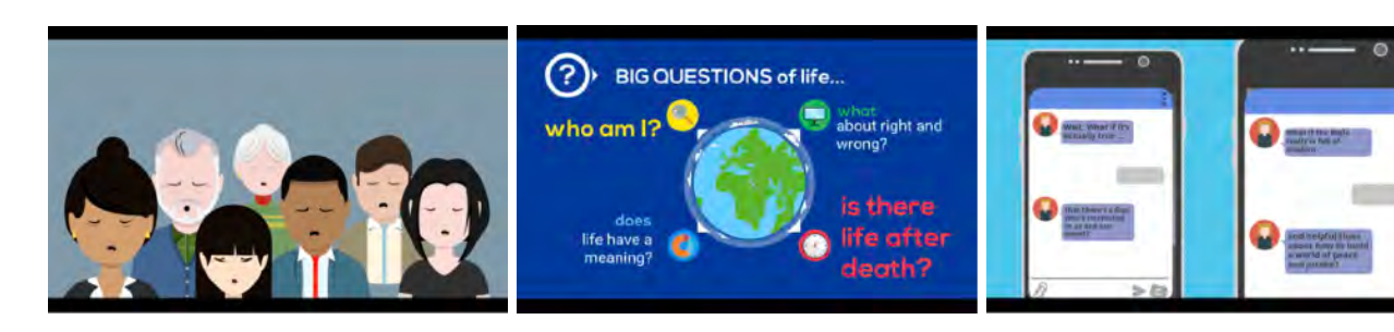
Religion that controls