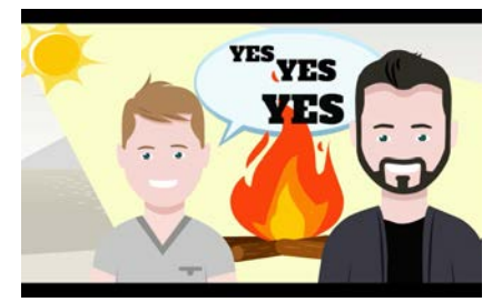
A second chance