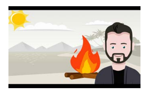
Group 2: Jesus Questions