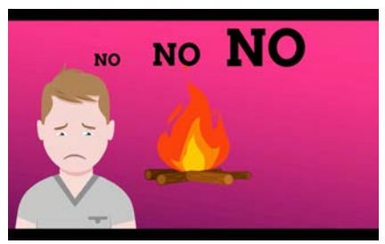
Peter denied Jesus