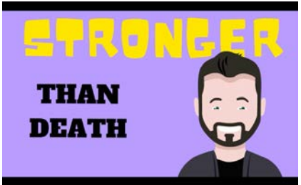
Stronger than death